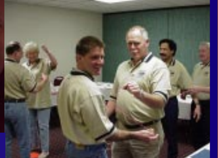
Ft Wayne Intl Airport